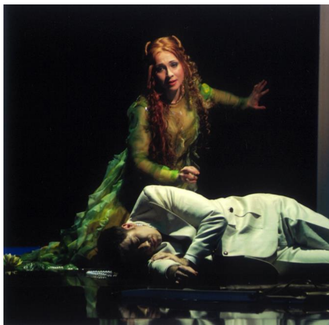
Rusalka (Theater Erfurt)