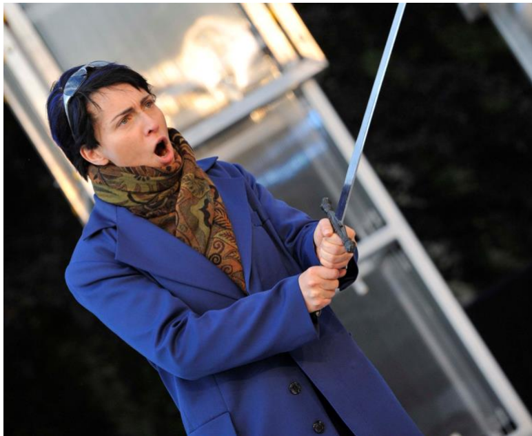
Rienzi (Meininger Theater)