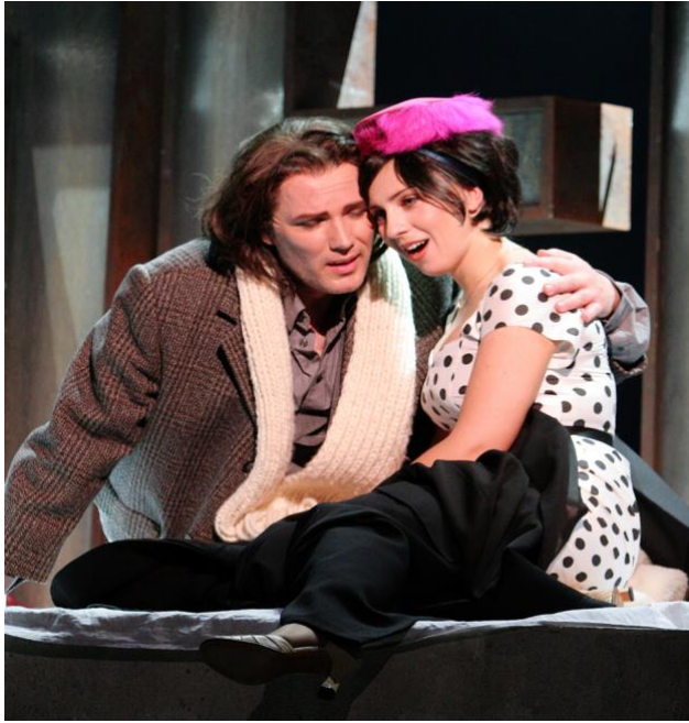
La Bohème (Theater Koblenz)