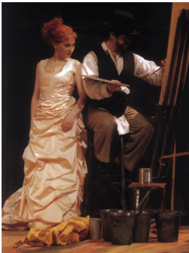
Der Zwerg (Theater Erfurt)