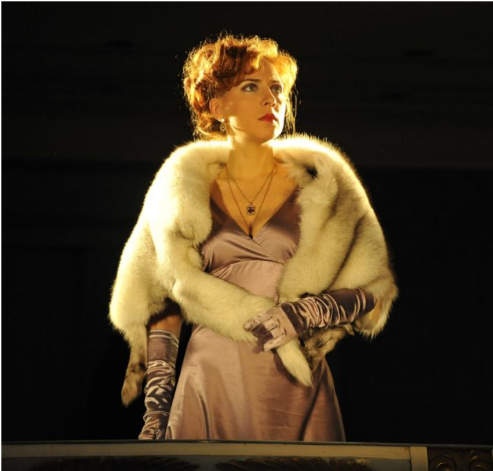
Guglielmo Tell (Meininger Theater)