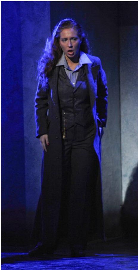
La forza del destino (Meininger Theater)